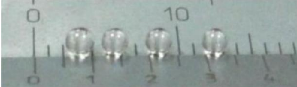
Figure 3. The glassy beads after synthesis under the ADL technique [2].

These glasses serve as ideal model candidates in order to elucidate their structural characteristics and thus try to find linkages between structure and properties in an effort to synthesize novel multifunctional materials with enhances properties. The glasses shown in Figure 3, are Yttrium Aluminate glasses in a compositional range 27 mol% \leq x \leq 30 mol% with x denoting the Y<sub>2</sub>O<sub>3</sub> content. In a recent study by our group [3] it was made possible to elucidate the coordination environment of Yttrium atoms by means of Nuclear Magnetic Resonance (NMR) spectroscopy and it was found that Yttrium atoms can occupy sites with 6 and 8-fold coordination polyhedra.