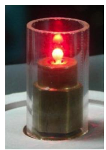
Figure 2. The copper jet with the spherical bead just before melting [2].